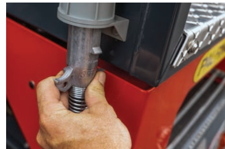
Retract and stow the suzie cable