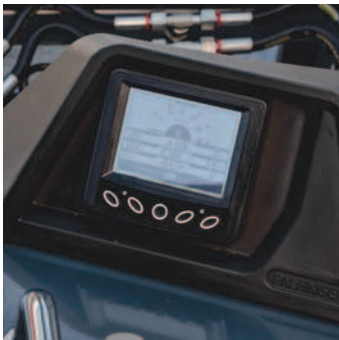
Digital display and easy-reach control levels with armrest