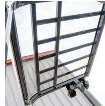
All-weather glass overhead guard cover