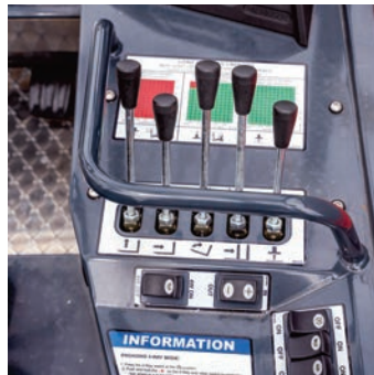
Conveniently located weather-resistant control switches