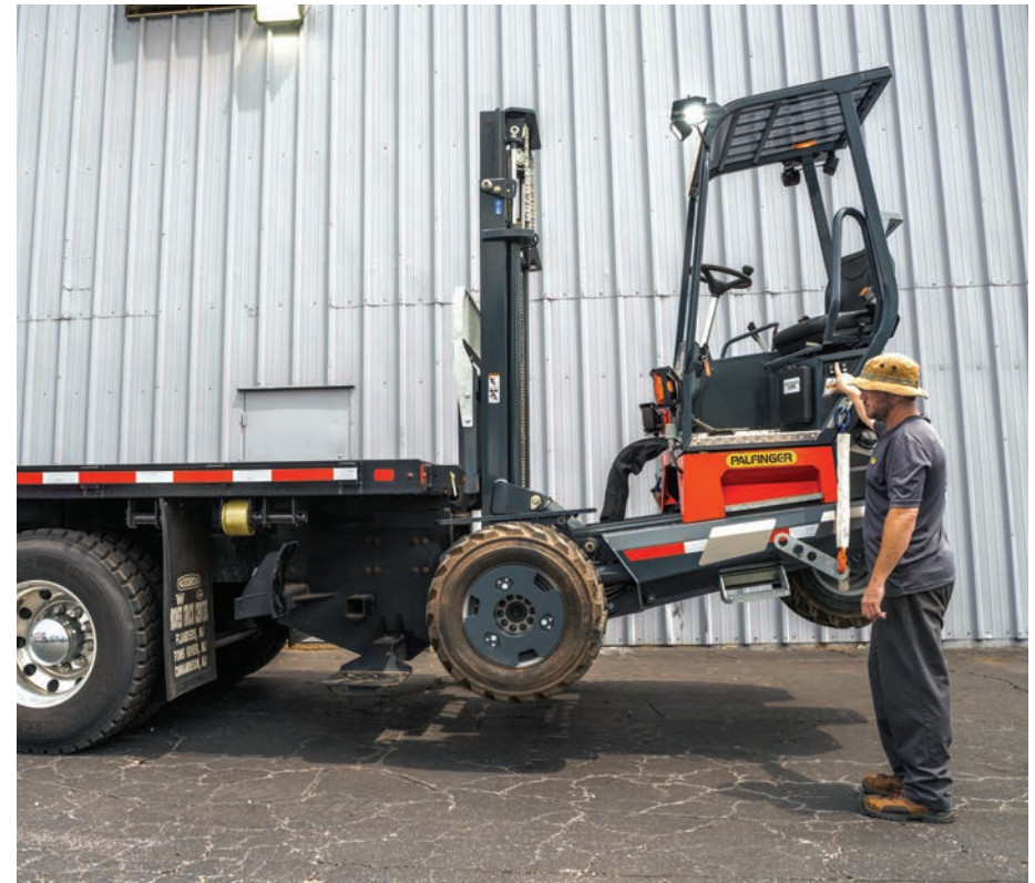
Lower the forklift and go...use the three switches to TILT, EXTEND and LOWER the machine to the ground

By eliminating operator slip and strain hazards from climbing on and off a truck-mounted forklift, PALFINGER's Ground Control System raises the standard in Operator Safety. Operators are no longer required to overextend themselves by trying to climb up on the forklift to dismount from the truck or trailer.