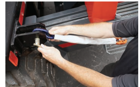
Unpin and stow the transport chains