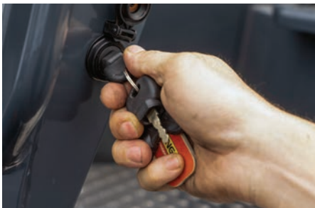
Start the engine with the ground level ignition key