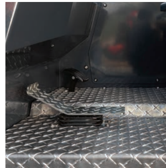
Ergonomically arranged foot pedals with ample floor space