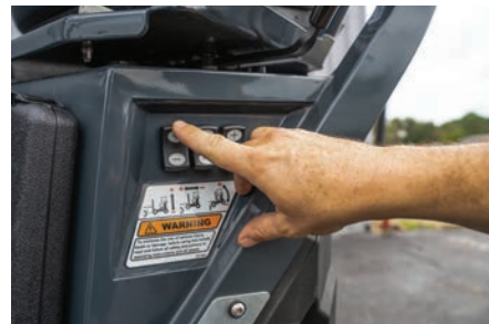
Relax the transport chains