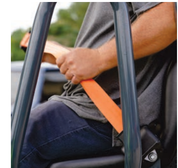
Deluxe seat with high visibility orange seatbelt and integrated side guard